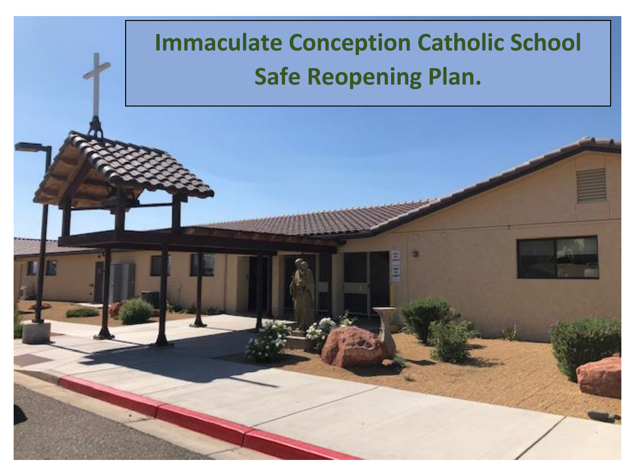
"I will instruct you and teach you in the way which you should go; I will counsel you with My eye upon you" Psalm 32:8